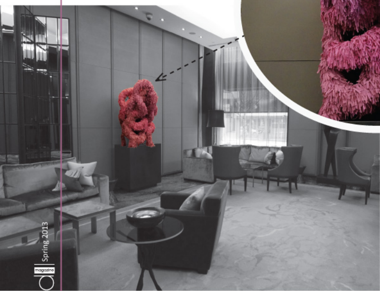
Clockwise from top Hazelton Hotel exterior, Plinth winning sculpture, Jaime Angelopoulos, "I See Through Them," 2011, cotton and polyester fabric, plaster, foam, 55" x 35" x 27". Courtesy of Parisian Laundry and the artist (Image courtesy of Sam Mogelonsky).

With over 25 galleries and museums within 10 minutes of its location, The Hazelton Hotel opened its doors with a unique art collection, focused on various mediums of contemporary art displayed throughout in its public and guest-only areas of the hotel. Even the valet parking area of the hotel welcomes guests with sand cast glass panels illuminated with an ever-changing colourful LED display by Jeff Goodman.