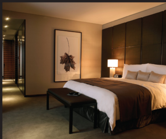
from top LOBBY: Bruno Billio, "Chromed Suitcase Sculptural Grouping," Nickel-plated aluminum, 156" x 30" x 24" and 84" x 26" x 13", 2007. PORTICO: Jeff Goodman, "Untitled," Sand Cast Glass panels with LED lights, 5 windows, each 102" x 102", 2007. SUITE: Andrew and Margaret Kisza, "Leaf," Giclée reproduction of original work on paper 40" x 68", 2007.